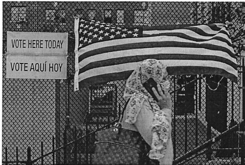
Gov. Phil Murphy and all 120 legislative seats are on the November ballot as well.

When a 2011 law went into effect allowing certain New Jersey towns to move their May local elections to November, 86 municipalities held their nonpartisan races in the spring.