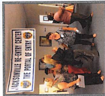
Fla. State Prison